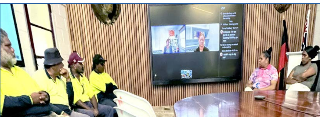
LEFT: Members of the RAES Team in the Council's Chamber Office last week.

“The goal is to make RAES on Palm Island a leading program for communities right across the region.”